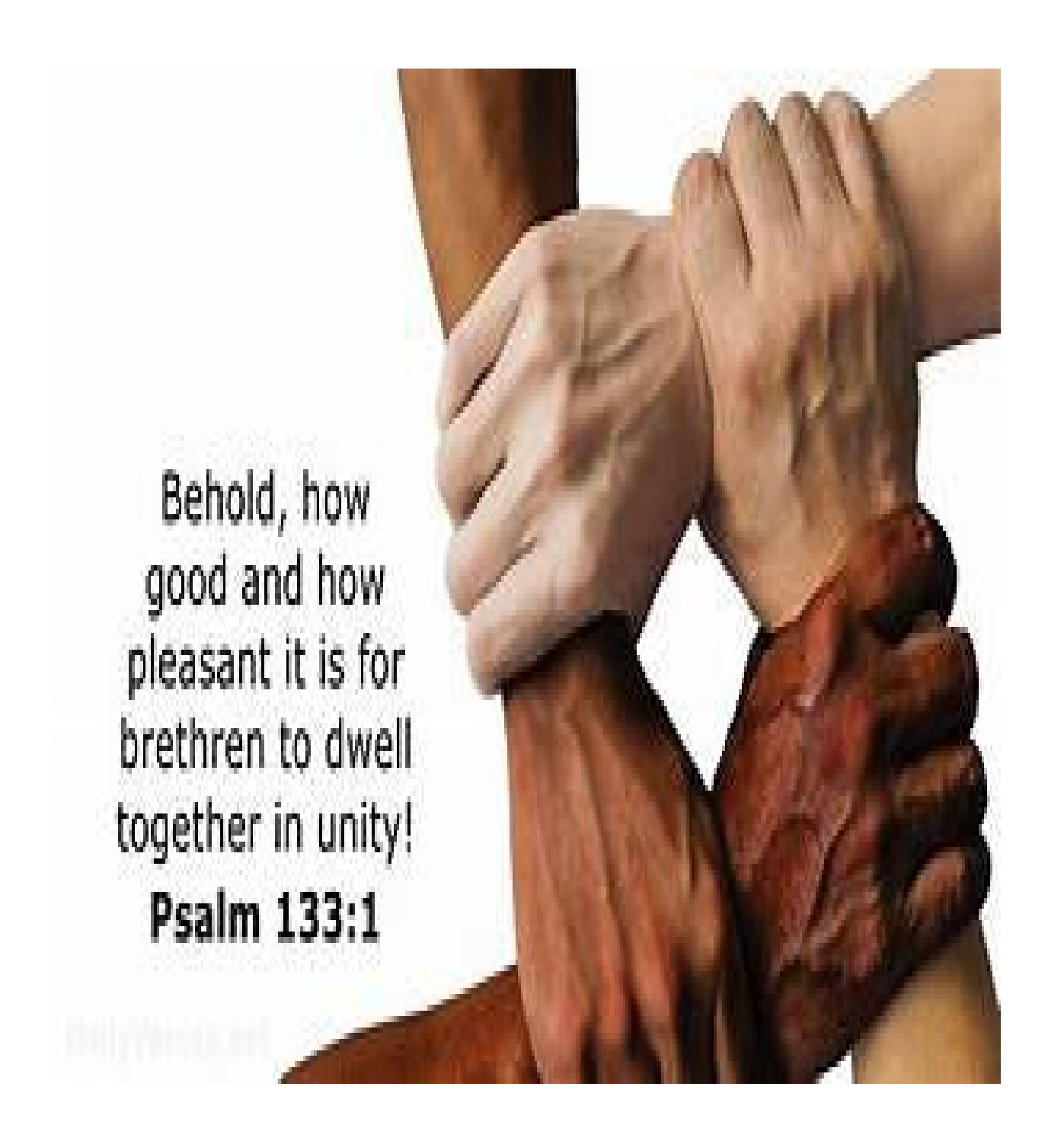
In Psalm 133:1, David exclaims, "Behold, how good and how pleasant it is for brethren to dwell together in unity